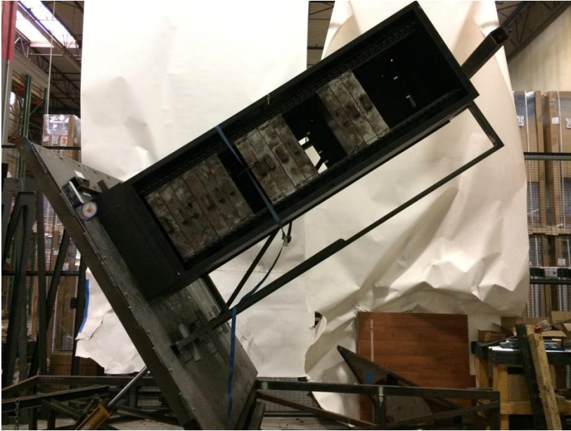
Photo 3 SR-46-32 at maximum inclination in side-to- side direction