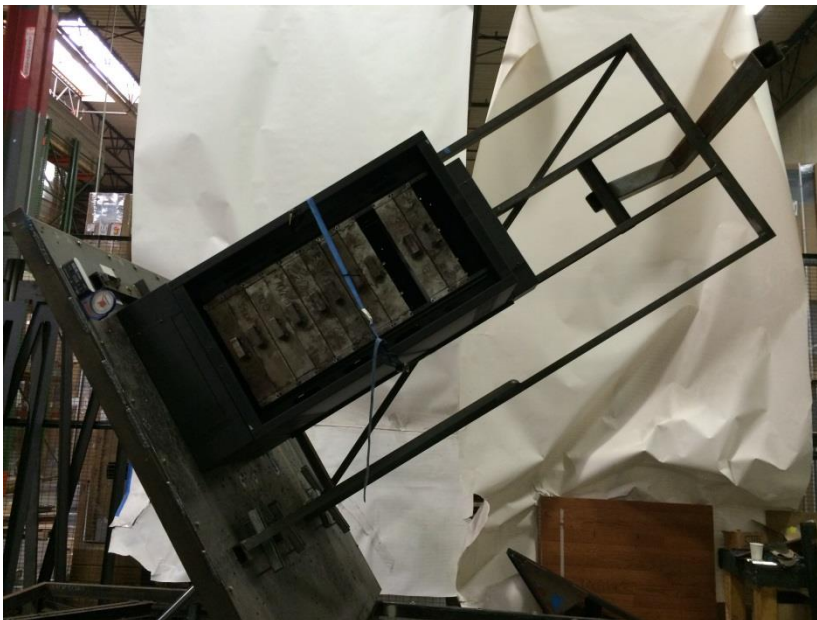
Photo 4 SR-24-32 at maximum inclination in side-to-side direction