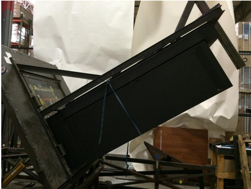
Photo 1 SR-46-32 at maximum inclination in front-to-back direction